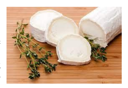
Yields 2 servings

Divide beet slices between two salad plates.* Scatter pecan halves over. Arrange goat cheese slices to the side of the beets. Grind black pepper over. Divide the prepared orange vinaigrette between the servings, spooning it over the beets. Chill in the refrigerator until ready to serve.